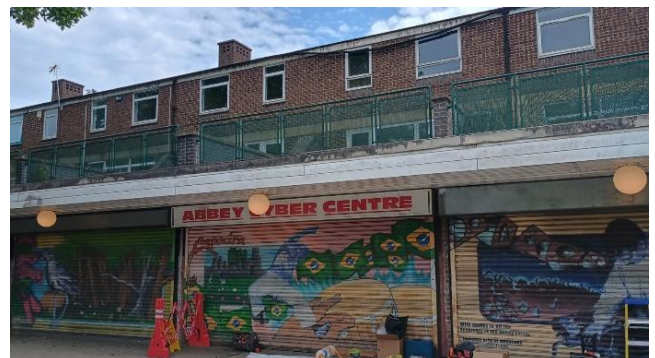
Image of the new lighting being installed in June 2025

We hope you've already seen some improvements with the new globe lights (pictured above) outside the shops on York Way. We're now looking forward to phase 2 of the works that looks at hanging lights within the trees around the Neighbourhood Centre to create soft lighting in green areas.